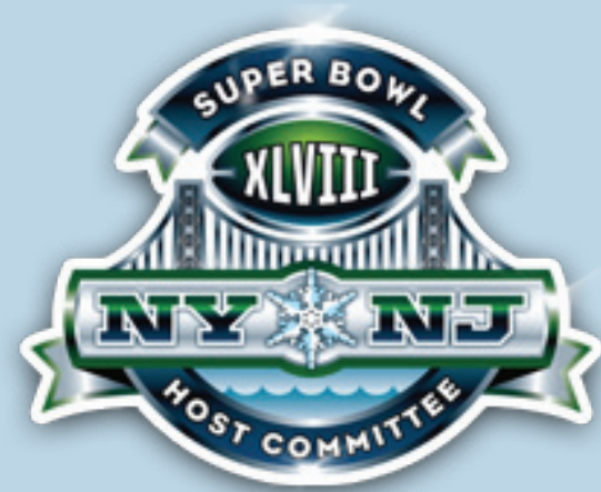
Super Bowl Sunday

Several residents have asked, "What happened to the horse racing game?" With all the holidays in the past few months, we've had to make room for holiday-themed events on our calendar where our old favorites previously were; however, we're off to the races again on Monday, Feb. 26 at 6 p.m.! Come, pick your favorite stallion or filly and cheer it on!