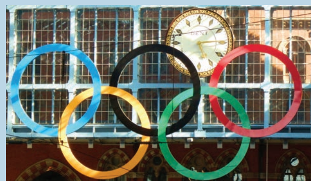
Winter Olympics in Sochi, Russia, Feb. 7-23