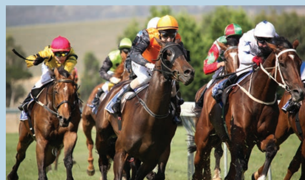
And they're off!