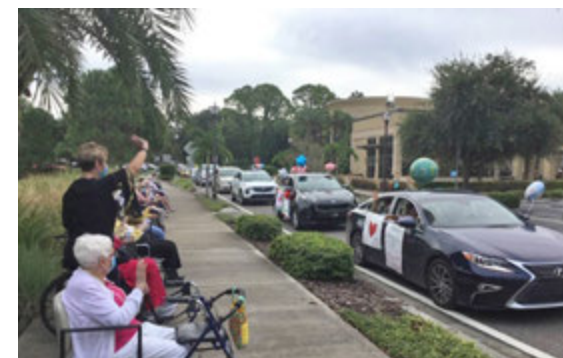
We had a great turn out for the Family Parade for National Senior Citizen Day!