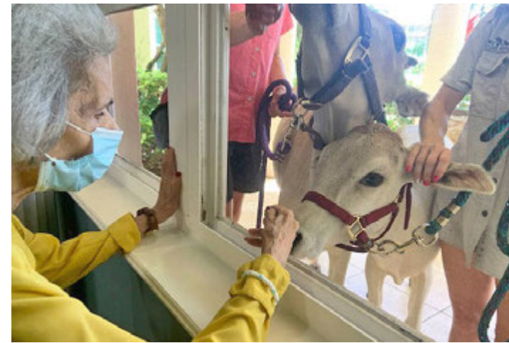
Rose is loving on Lucille the cow during Cow Appreciation Day!