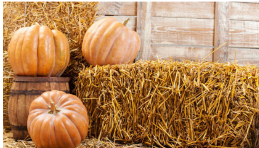
It's time for pumpkins, cool evenings and shopping!

By resident request, we will have our annual Fall Craft and Vendor Show on Thursday, Oct. 10, from 10 a.m. to 2 p.m., in The Parlor and in the lobby. It's a great time to start your holiday shopping or find a treasure for yourself. Not ready to think about the holidays? That's okay; our December holiday show is scheduled for Thursday, Dec. 12. Our vendors enjoy bringing their items to you and spending time chatting with you as well.