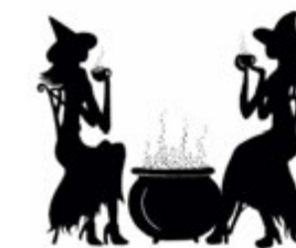
Come sit a spell!

Kindly RSVP in the white outing book located at the reception desk by Oct. 21.