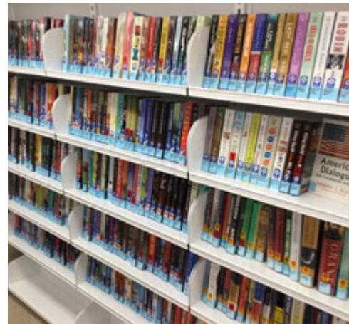
Movies are also available.