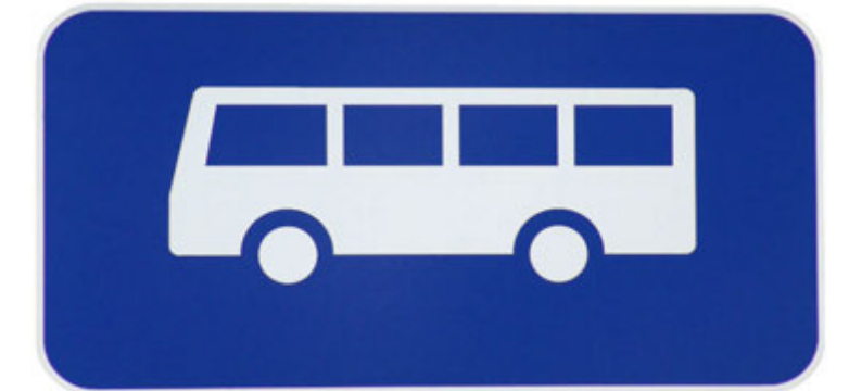
Kindly sign up for all outings.

Also, please plan to arrive five minutes before the scheduled departure time.