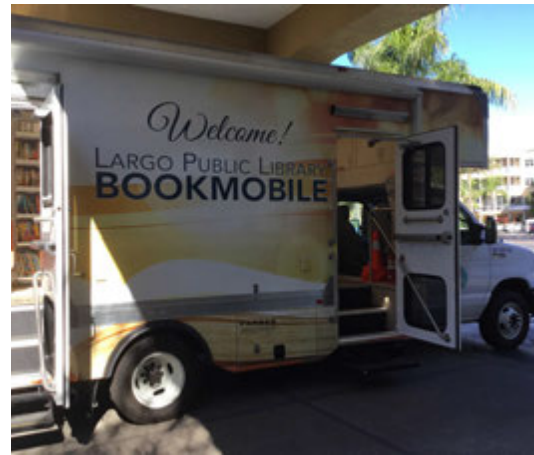
Reading is fun.

The bookmobile will be here on Thursday, Oct. 3, 17 and 31, at 11:15 a.m., under the portico at the entrance to our building.