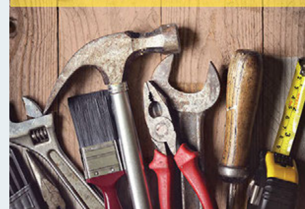
Regal has the best!

You are the nuts and bolts of our community!