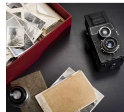
Looking forward to sharing the memories!

Just a reminder, photos of all our National Assisted Living Month 2019 fun will be featured in the November issue of the Good Life News.