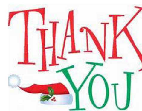
Regal residents and family members

The entire Regal Palms team wishes to share a big thank-you to each resident and family member who contributed for their generosity. And to the committee, thank you for taking on this huge initiative. We know it's not an easy task and you are appreciated. This year has been a challenge due to COVID-19. However, thank you for recognizing that resident care is and always will be our top priority.