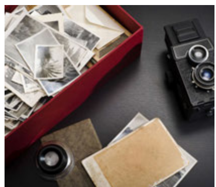
Looking forward to sharing the memories!

Just a reminder, photos of all our National Assisted Living Month 2019 fun will be featured in the November issue of the Good Life News.